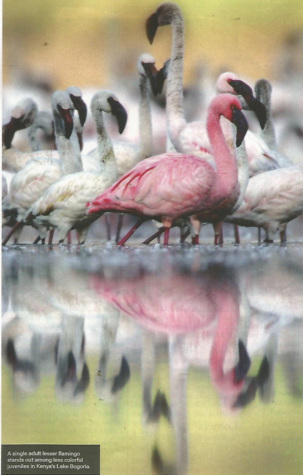
A single adult lesser flamingo stands out among less colorful juveniles in Kenya's Lake Bogoria.